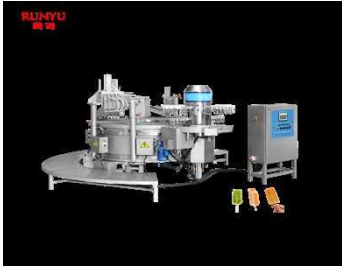
RXGJ-12 Rotary Stick Ice Cream Machine