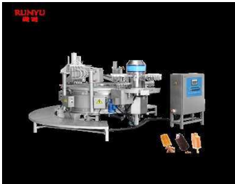
RXGJ-3 Rotary Stick Ice Cream Machine