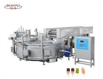
RXGJ-6 Rotary Stick Ice Cream Machine